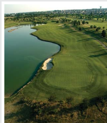
Fazio Golf Course

Log on to www.fcadallas.org for updated information! 214-739-8003