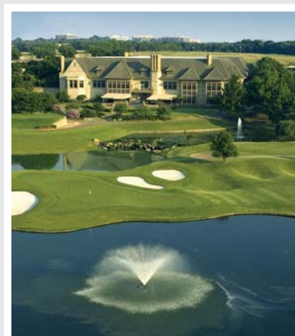
Stonebriar Country Club

As a result, Interstate Batteries is now one of corporate America's stunning success stories, a robust company that enjoys an unparalleled reputation for excellence and honesty.