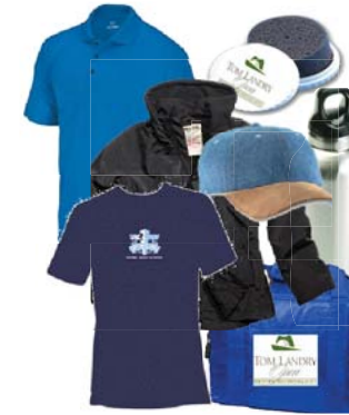
Sample photos, these do not represent actual gift bag items.

Player gift bags valued at over $250 to include items such as a golf shirt, ball cap, t-shirt, windbreaker, fleece wear, water bottle, golf balls and much more!